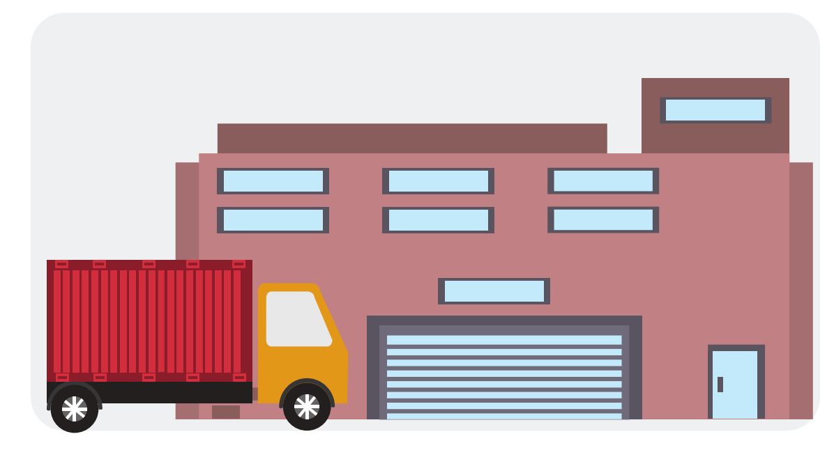
CFS warehouse makes arrangements to pick up container from the port and drays container to their bonded facility for devanning