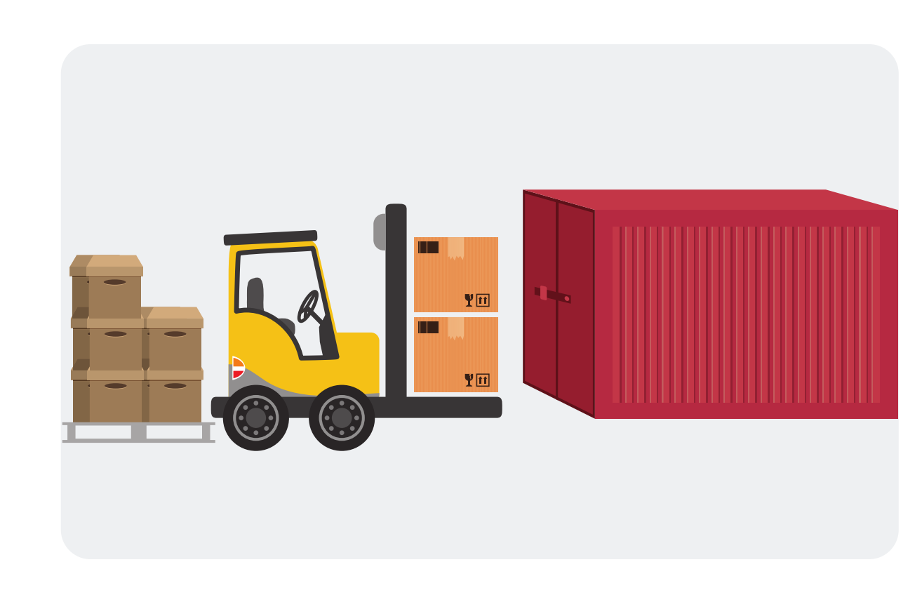
LCL cargo is then loaded into a consolidated container at the CFS warehouse