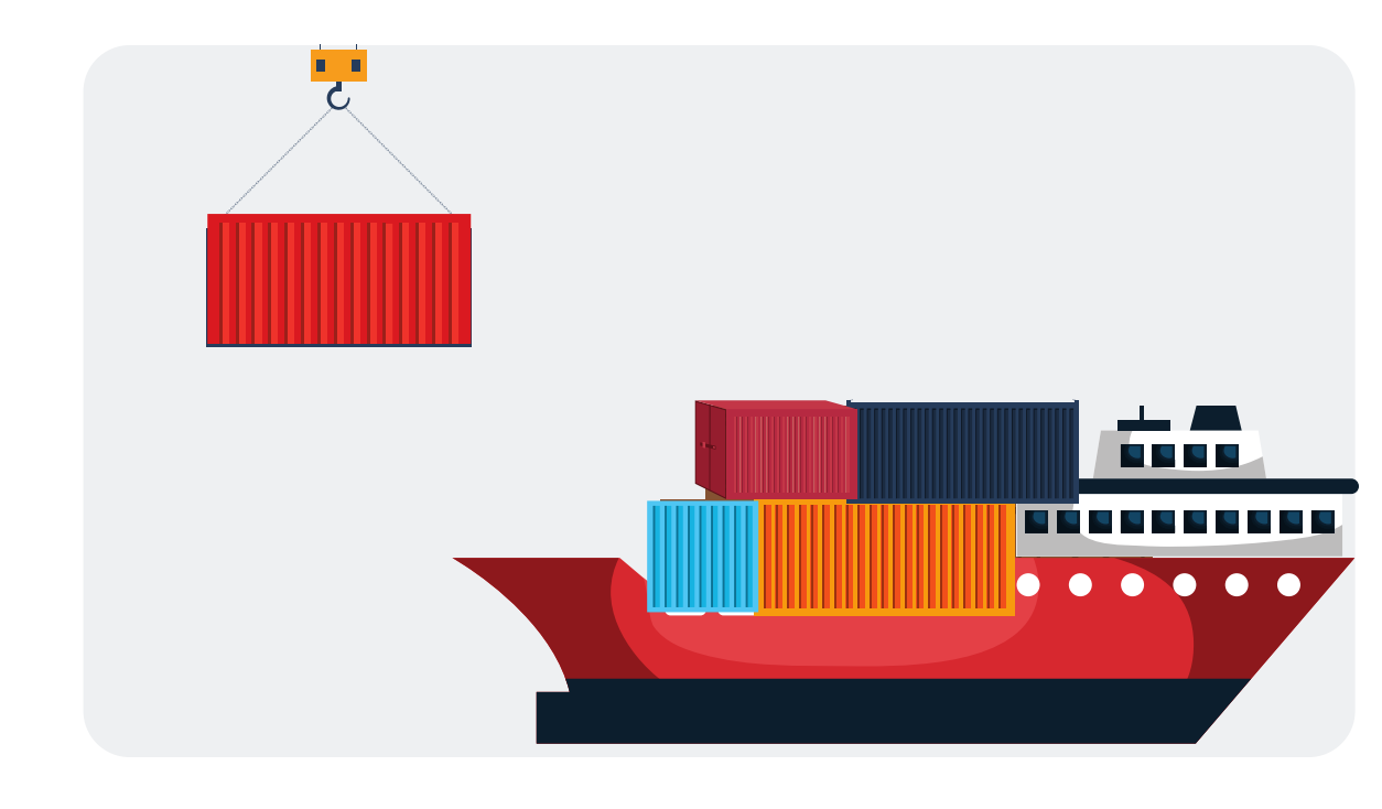
Container is loaded onto vessel