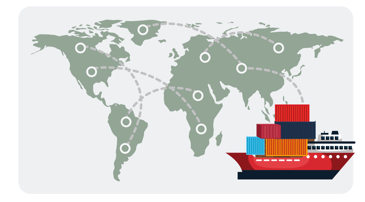
Vessel departs with container on board to destination port.