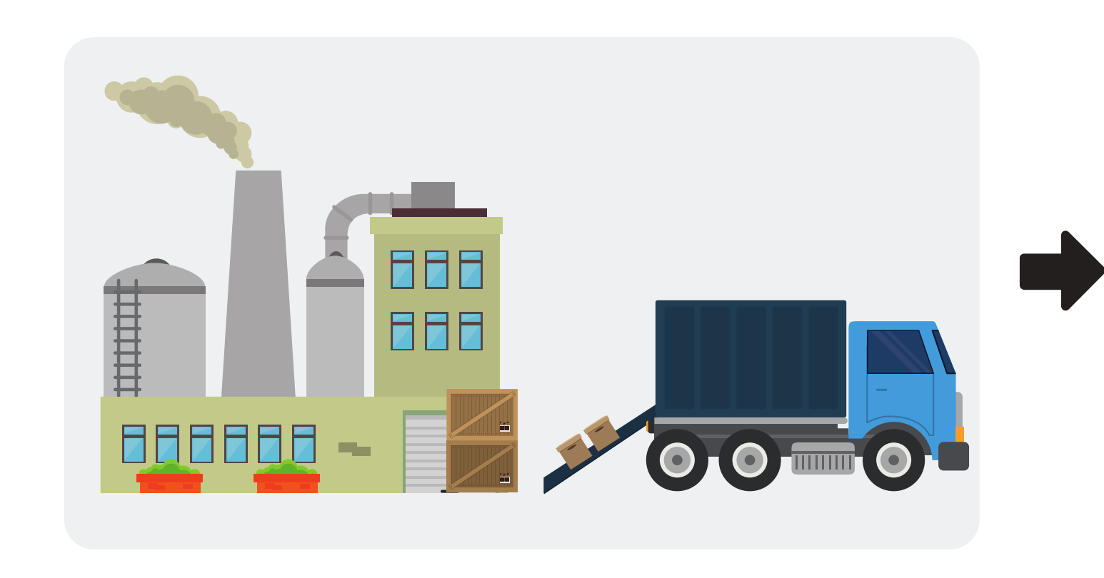
Factory or CSL arranges pick up and delivers cargo to consolidating warehouse (CFS warehouse)