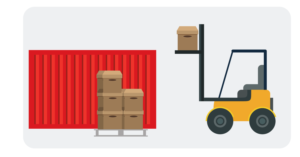
Cargo is devanned from container at CFS warehouse