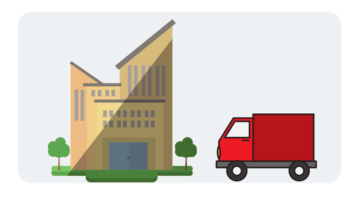
CSL arranges trucking to deliver cargo to buyer's final destination address