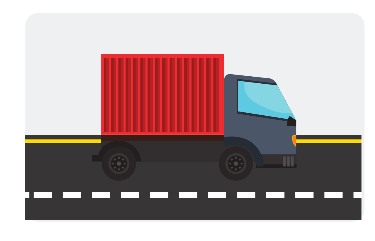
Container is then transported to port of loading